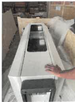
240kW unit in storage at Pershing Facility